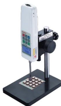
SPF Keystroke Test Stand

Note : Can be configured (purchase additionally)with SPF Keystroke Test Stand.