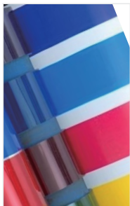
Ink & Printing

Yd5050 with optional apertures(φ2/4/8mm),It is widely used in ink printing,paper,painting,scientific research and laboratory. especially suitable for precise measurement and quality control of optical density and dot enlargement in ink printing.