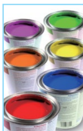
Paint & Ink