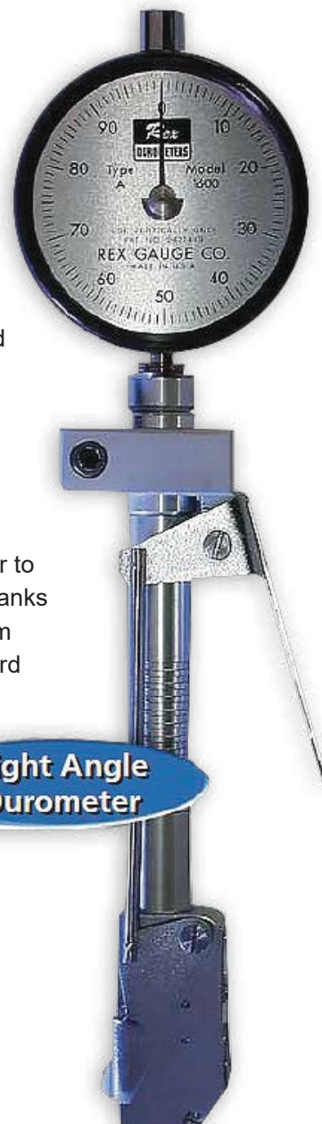
Right Angle Durometer

Designed specifically for checking tires in racing applications, the 2100 is essentially a type A gauge with a few added features. The gauge is lighter than the standard model 1600, is furnished with a clip-on sheath, has a special dial face and hand, and is black anodized.